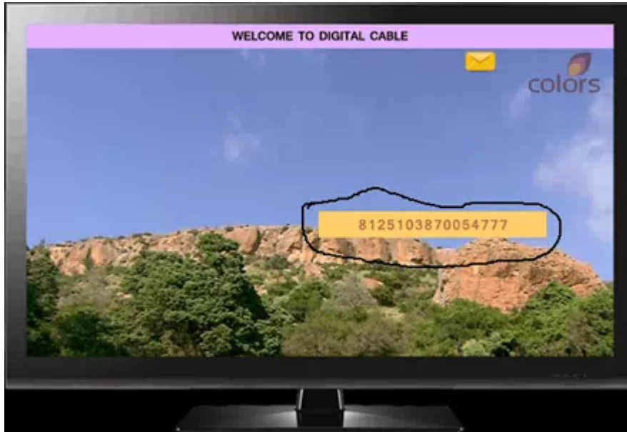
Image of Random Numbers on Your Tv Screen

Q. (1) Have you seen these random numbers on your TV screen? What they mean?