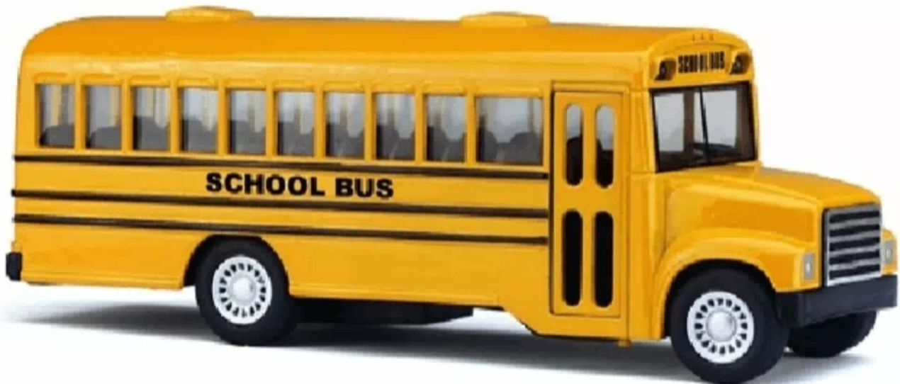
Image of School Bus