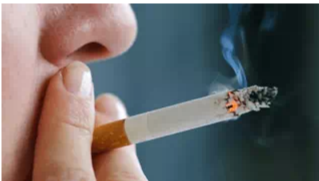
Governments Do Not Ban Tobacco Products

Q. (5) Why don't governments ban cigarettes and other tobacco products if they are so injurious to health?