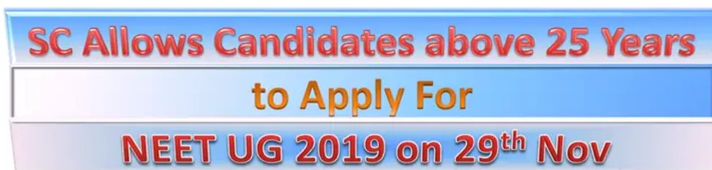
Image of NEET UG 2019 on 29 th Nov

NTA has released NEET Application Forms from 1 st Nov. , 2018. Intermediate graduates (10 + 2) with min. of 50 % aggregate marks in qualifying examination can apply online at nta. ac. in. For admission into UG courses in AYUSH, students must appear for NEET