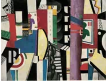
Image of Visual Art

Visit examrace.com for free study material, doorsteptutor.com for questions with detailed explanations, and "Examrace" YouTube channel for free videos lectures