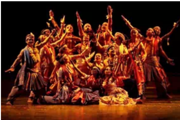
Image of Performing Arts