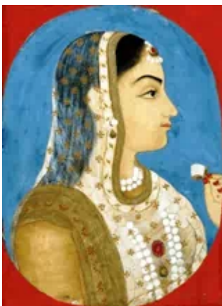
Image of Indian Art