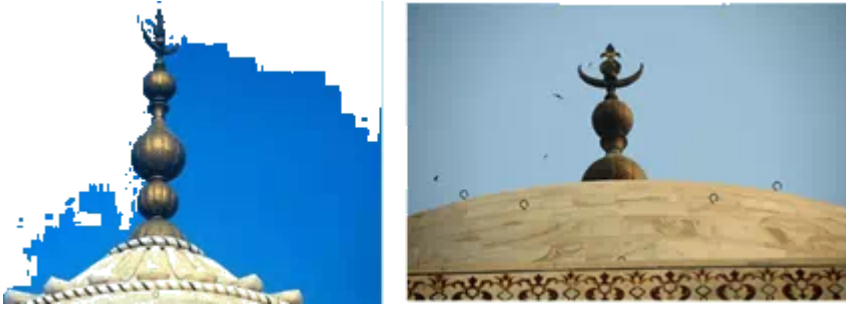
Image of Tajmahal's Top Part