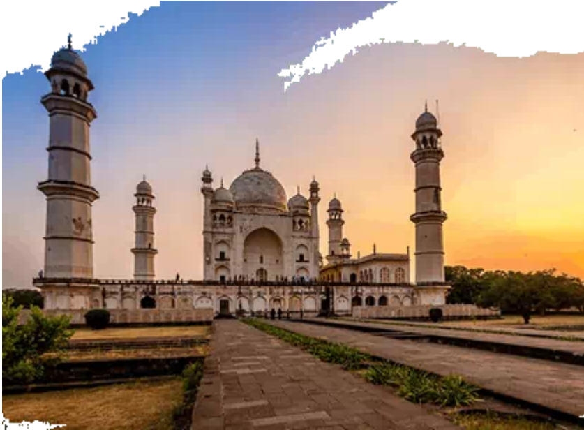
Aurangzeb's Bibi Ka Makbara

Visit examrace.com for free study material, doorsteptutor.com for questions with detailed explanations, and "Examrace" YouTube channel for free videos lectures