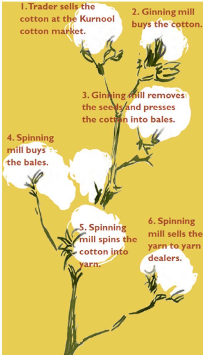
Image of Six Trend of Cotton